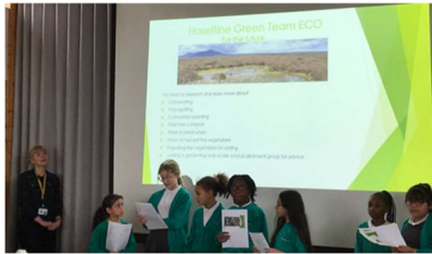
Our fantastic Eco-Warriors and their pitch.