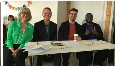
Lewisham's 'scary' dragons!